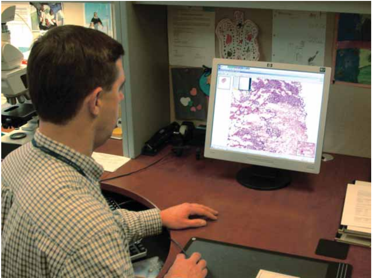
Reviewing a frozen section.

can simply access the slide from their desktop computers with minimal disruption or delay. They are also able to take turns controlling the cursor to point out different aspects of a given slide. This has proved to be a more efficient method than physically aggregating in one room.